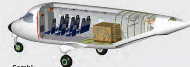
Combi (passenger/cargo mix)

Rapidly configurable, the M28® aircraft can be equipped in a number of rugged mission applications, including cargo/utility, border patrol/SAR and paratroop transportation.