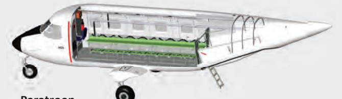
Paratroop (17 seats)