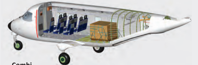
Combi (passenger/cargo mix)

Rapidly configurable, the M28® aircraft can be equipped in a number of rugged mission applications, including cargo/utility, border patrol/SAR and paratroop transportation.