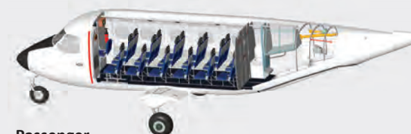
Passenger (19 seats or 18+ lavatory)