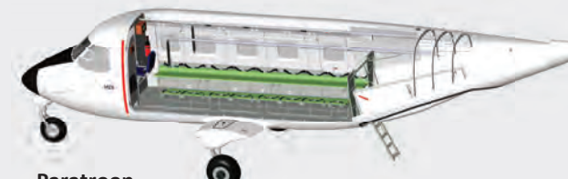
Paratroop (17 seats)